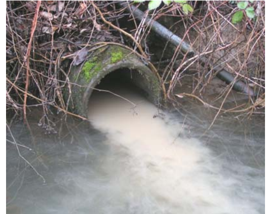
Currently illegal discharges like this would be legal under the newly proposed rules.

Issue Overview: On October 19, 2005 DEQ released a proposed revision to Oregon's water clarity (i.e., turbidity) pollution standard that would radically weaken controls on water pollution that degrades water clarity in the State. The description below details how the key provisions of this precedent-setting rule would fundamentally change Oregon's existing water clarity standard and pose a direct threat to fish, wildlife, the aesthetics of Oregon's rivers and streams, and other beneficial uses. The most striking part of the rule is that for large rivers like the Columbia and Willamette, the proposed standard would eliminate all protections for water clarity within a 300-foot mixing zone that DEQ has for the first time ever built right into a water pollution standard.