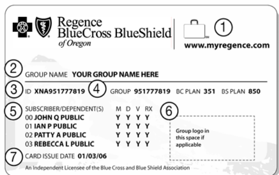
Sample: card front